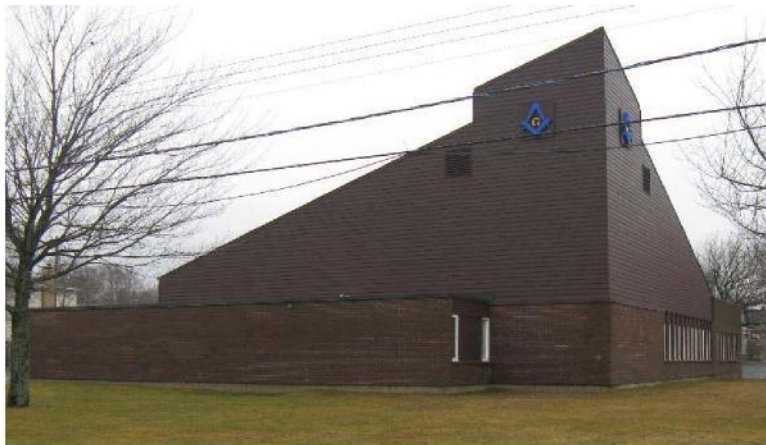
Freemasons' Hall, Fairview – 2013