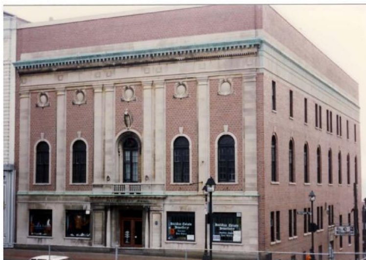
Former Freemasons' Hall, Barrington St. Halifax