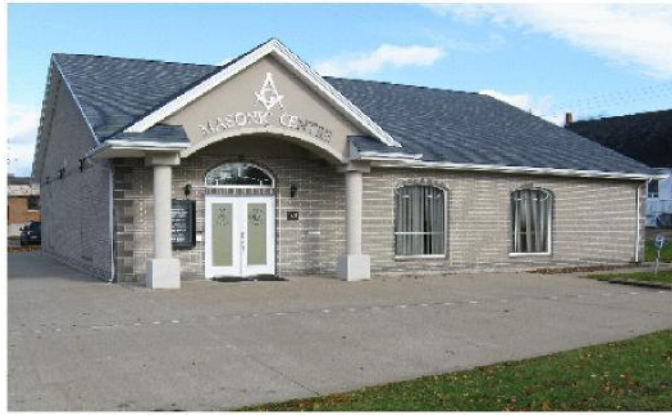
Tru-Fel Masonic Centre, Bible Hill