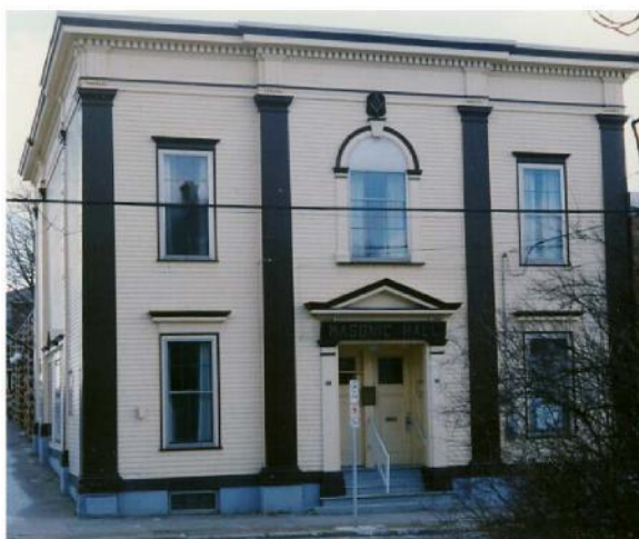
Eastern Star Lodge, No. 51, Ochterloney St. Dartmouth 1909 - 2005

Other Dartmouth lodges, Fidelity Lodge, No. 119 , John Albro Lodge, No. 122 , and Woodlawn Lodge, No. 131 , all met in different locations in Dartmouth. Each was later approached to purchase shares in the new Building Company.