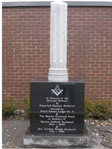
Broken Column erected by Royal Sussex Lodge, No. 6

Widows & Departed Brethren ". The monument is located to the left of the main entrance to Freemasons' Hall, on Coronation Avenue, Fairview.